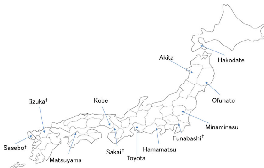
Fig. 1. Study sites to evaluate the effectiveness of dispatcher training in increasing bystander chest compression for out-of-hospital cardiac arrest patients in Japan, selected by population size. †Excluded from study.

As this was a secondary data analysis, the number of patients was determined in advance. Thus, we calculated power based on the given sample size to indicate the appropriateness of the size, rather than calculating required size. A total of 249 and 283 OHCA patients were included in the analysis before and after the training, respectively. Assuming that appropriate chest compressions implementation rates would be 20% before education, and that this would